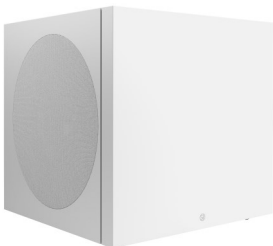
Signature Sub 8: A truly powerful and compact subwoofer.

To get the most out of your new subwoofer, I recommend that you carefully read this guide before connecting them.